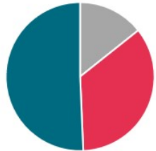
2019 Total Revenue

■ Fundraising ■ Investments/Other ■ Program Service Fees